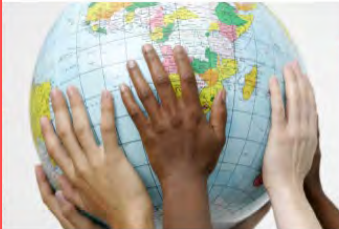
Servizi Psychological Assistance