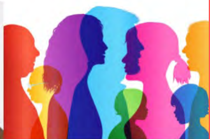
Servizi per i Dipendenti e i loro Famigliari