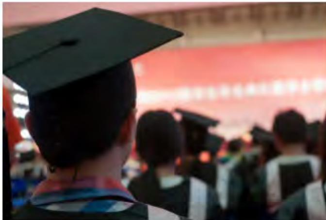
Servizi per gli Studenti

SCUP - CENTRO ATENEO DEI SERVIZI CLINICI UNIVERSITARI PSICOLOGICI