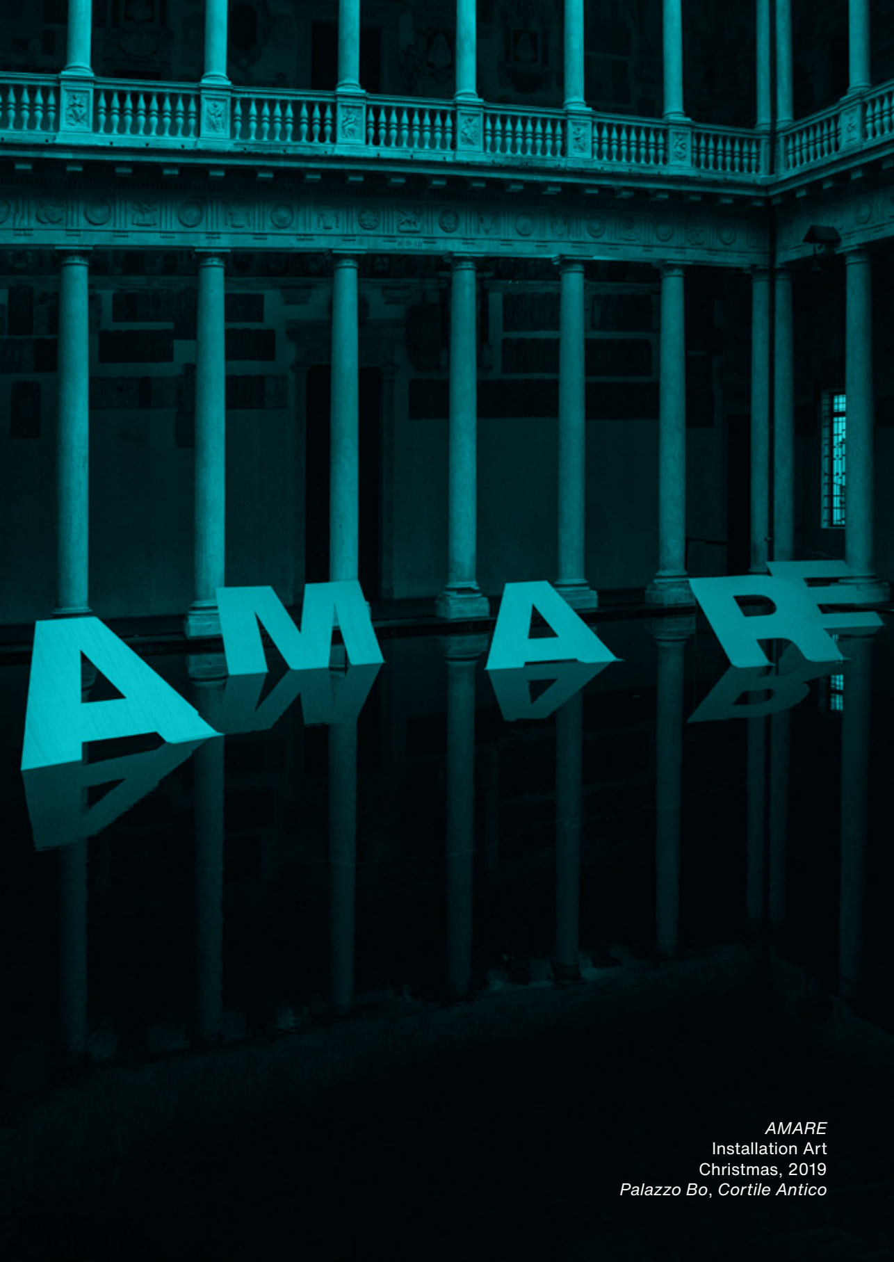
AMARE Installation Art Christmas, 2019 Palazzo Bo, Cortile Antico