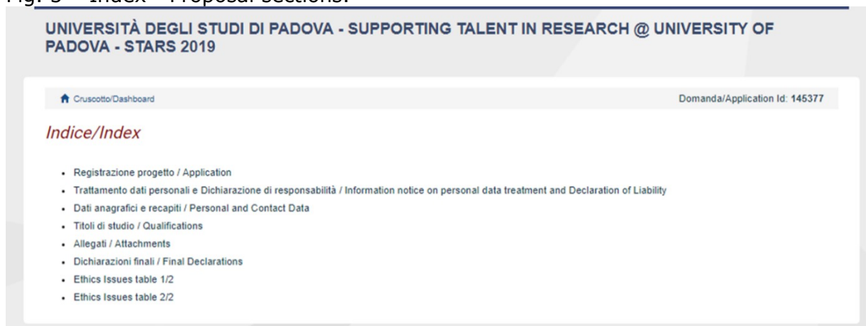
Fig. 5 – Index - Proposal sections.

Please remember to click on “Salva e prosegui/Save and proceed” after you have entered the requested data in each section.