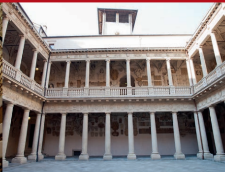
The Old Court