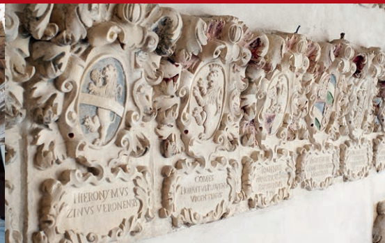
Heraldic Crests, the Old Court