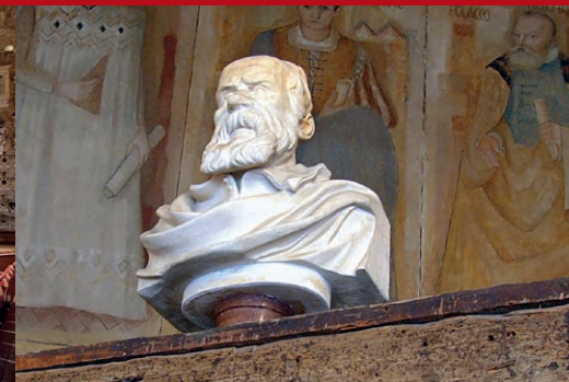
Galileo's Rostrum, Sala dei Quaranta